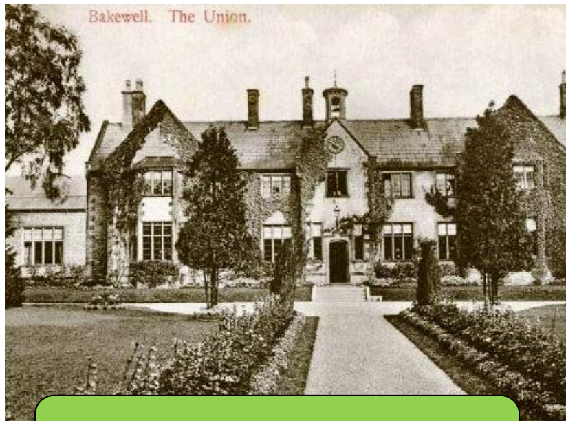
Bakewell Union Workhouse, [c. 1900]